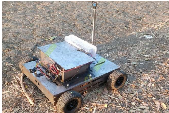
Figure 2 Final Model