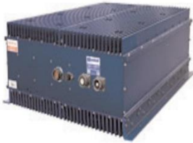
Figure 3. Maxwell 390V HTM Module

Assuming six recharge events per hour (one every ten minutes), ten hours of bus service per day, five days per week, and 50 weeks per year, the ultracapacitor system would experience a total of 15,000 cycles per year. This amounts to approximately 200,000 cycles of the ultracapacitor over a 12-year bus life expectancy, well short of the 1,000,000 projected cycle life and suggestive that ultracapacitor reliability would be extremely high during the operational life of the bus.